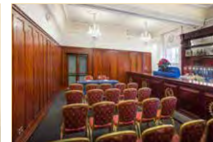
The Essex Room