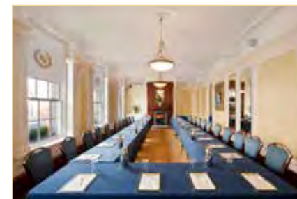
The Abbey Room